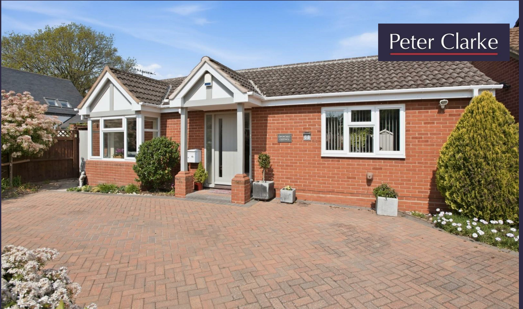
Churchill Cottage, 6A Winston Close, Shotton, Stratford-upon-Avon, CV37 9ER